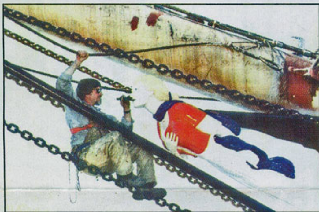
PAINTED LADY...the Glenlee's figurehead is lovingly restored